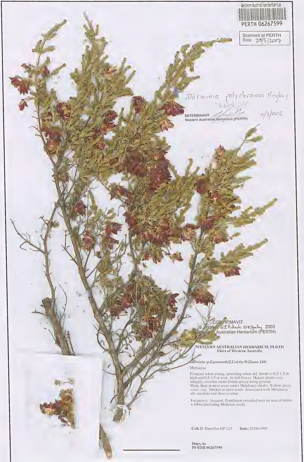
Figure 8. Holotype of Darwinia polychroma , scale = 5 cm.